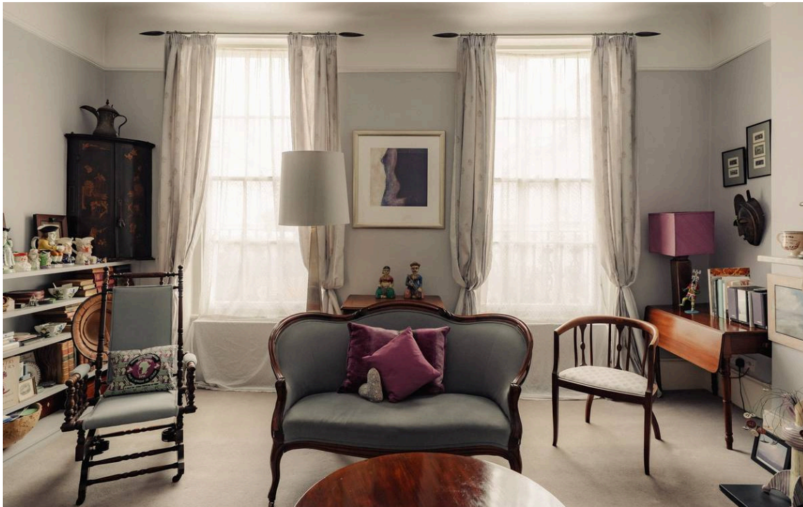
The Reception Room