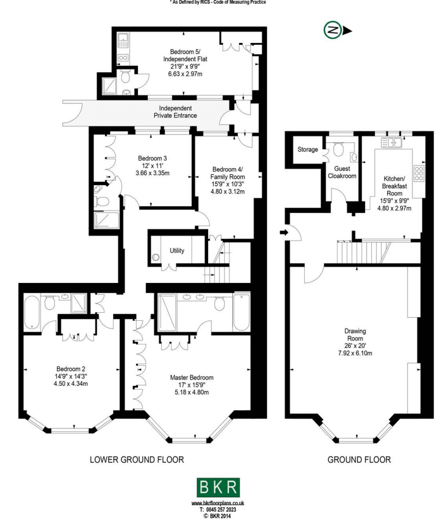
Illustration For Identification Only, Not to Scale All Calculations include AnylAll Areas Under 1.5m Head Height. *As Defined by RICS - Code of Measuring Practice

APPROX. GROSS INTERNAL AREA * 2353 Ft 2 - 219 M 2